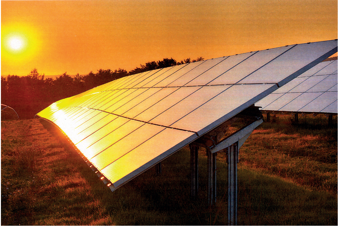
Photograph E for Question 4