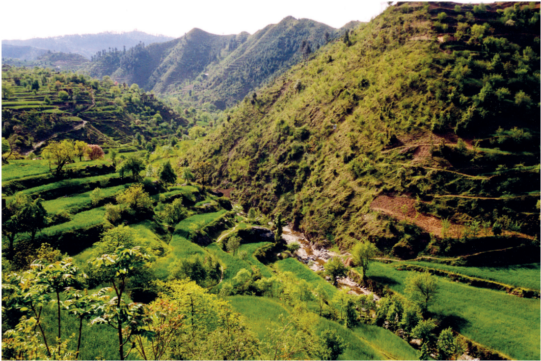
Photograph C for Questions 3 and 4