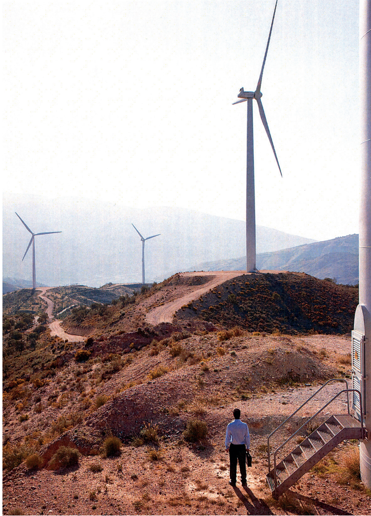
Photograph D for Question 4