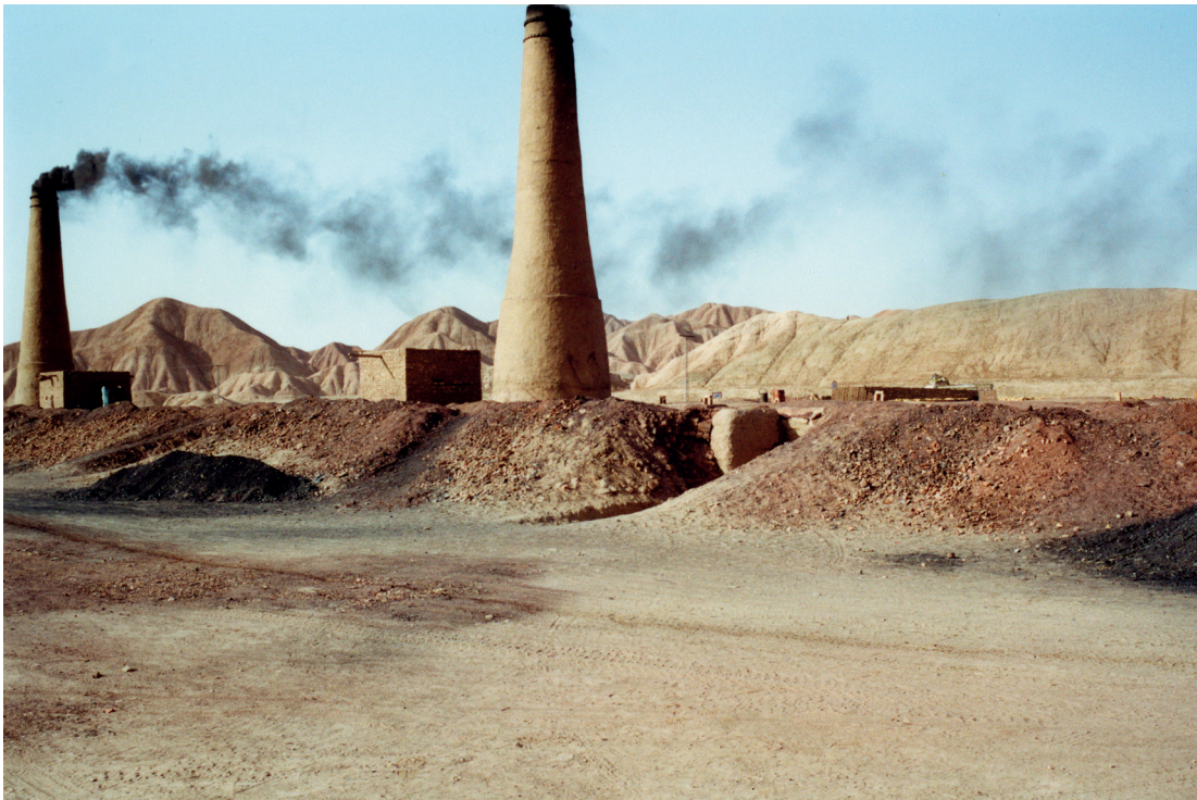
Photograph B for Question 2