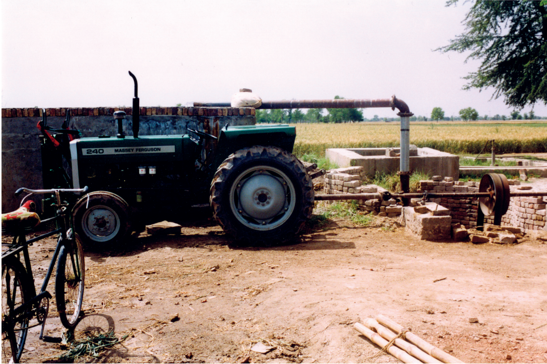
Photograph A for Question 1