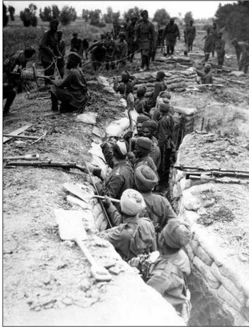
Sepoys at war

The Muslim League and Congress were both calling for self-government by 1913. The Muslim League, however, had to be careful: if the British left India before safeguards were in place, Muslims would not gain self-rule. They would be dominated by the Hindus and could expect little say in how they were governed. Congress had to be convinced that they needed to work with the Muslim League in order to win their support in the search for self-rule. In December 1916 the first and only meeting was held between the leaders of the Muslim League and Congress, which led to a joint proposal to put in front of the British.