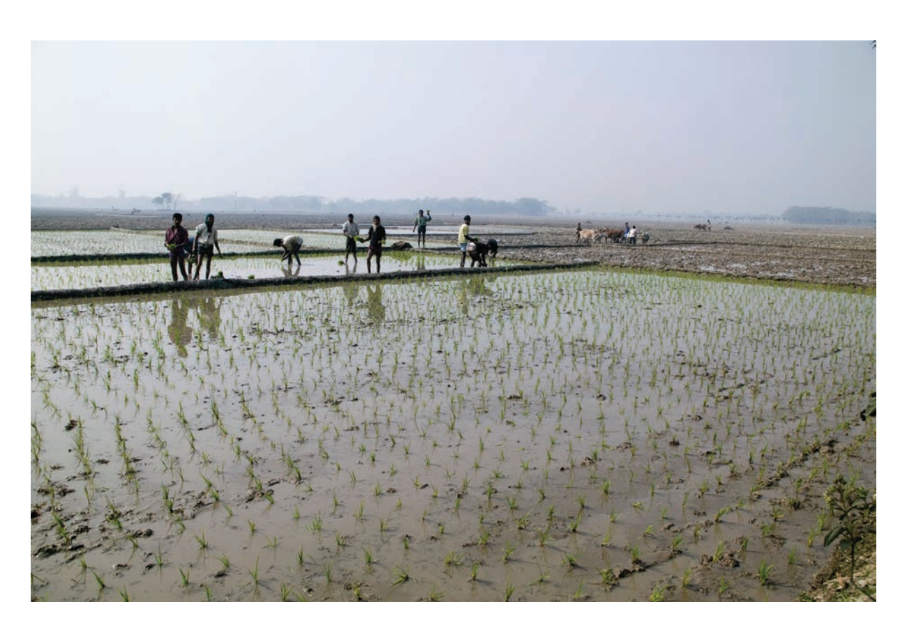
Photograph A for Question 3(a)