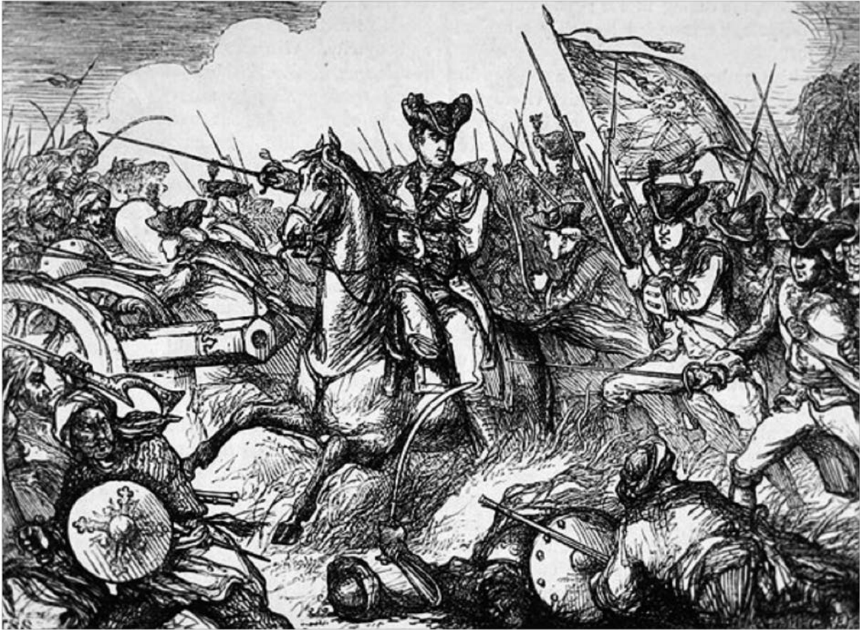
An eighteenth-century British print of the Battle of Palashi (Plassey)

During the war with France, which broke out in 1756, the British used internal divisions in Bengal to their advantage. They weakened the position of Sirajuddaula and when the disputes between the Nawab and the British led to conflict, it was the East India Company that was victorious. The decisive battle took place at Palashi in 1757. The British installed a puppet ruler in Bengal. British influence was extended by the acquisition of three districts in 1760 and by gaining the right to collect revenue. A treaty of 1765 allowed Bengal to be ruled by collaborators with the British in return for surplus revenues, but the rule of the Company did little for the people of Bengal. There was considerable hardship in the Great Famine of 1769–1770 and as a result of reforms to Company rule, such as the Permanent Settlement of 1793.