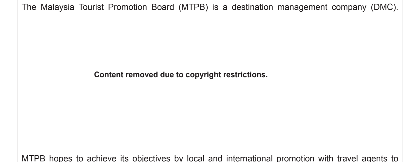
Fig. 2.1 for Question 2

create and sell attractive packages to Malaysia.