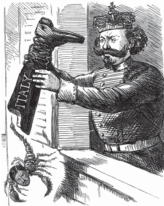
THE ITALIAN BOOT.

A cartoon published in Britain on 2 March 1861. The creature in the bottom left represents Leopold II, Grand Duke of Tuscany. The figure on the right represents King Victor Emmanuel.