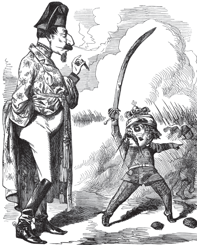
THE GIANT AND THE DWARF.

A British cartoon published on 11 June 1859. Napoleon III is saying to Victor Emmanuel, 'Bravo, my little fellow! You shall do all the fighting, and we'll divide the glory!'