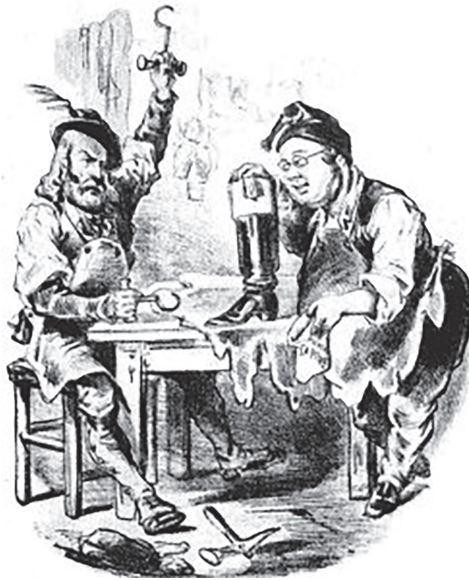
A cartoon from 1861 showing Cavour and Garibaldi making 'the boot' of Italy.