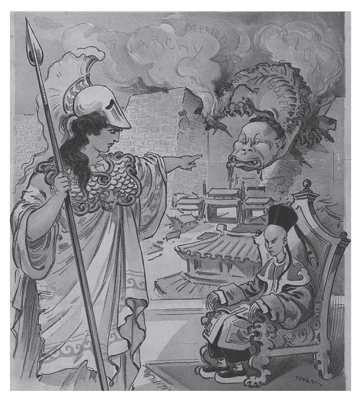
A cartoon published in an American magazine, August 1900. The caption reads 'The First Duty. Civilisation speaking to China: "That dragon must be killed before our relationship can be improved. If you don't do it, I shall have to."'