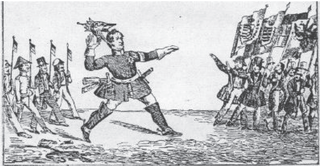
A cartoon published in Germany, March 1848. King Frederick William IV is saying to the revolutionaries, 'You up ahead! Hurry to me because I want to lead the movement.'