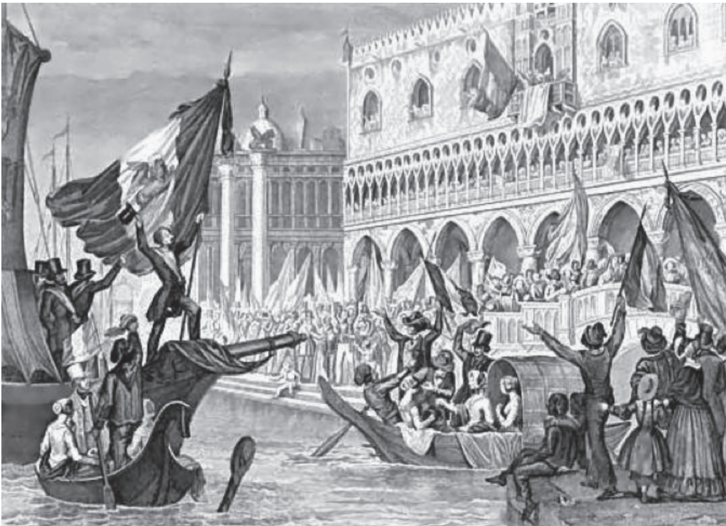
A drawing from the time of Daniele Manin proclaiming the Republic of Venice in 1848.