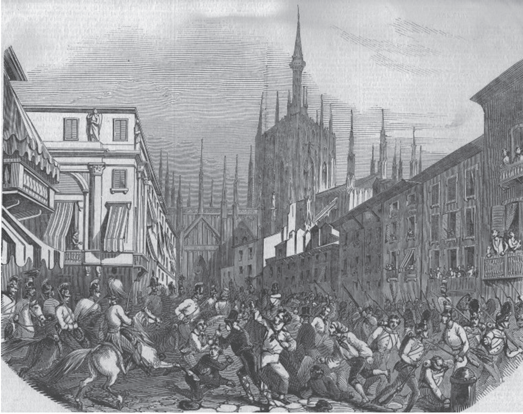
A drawing from the time of the uprising in Milan in March 1848.