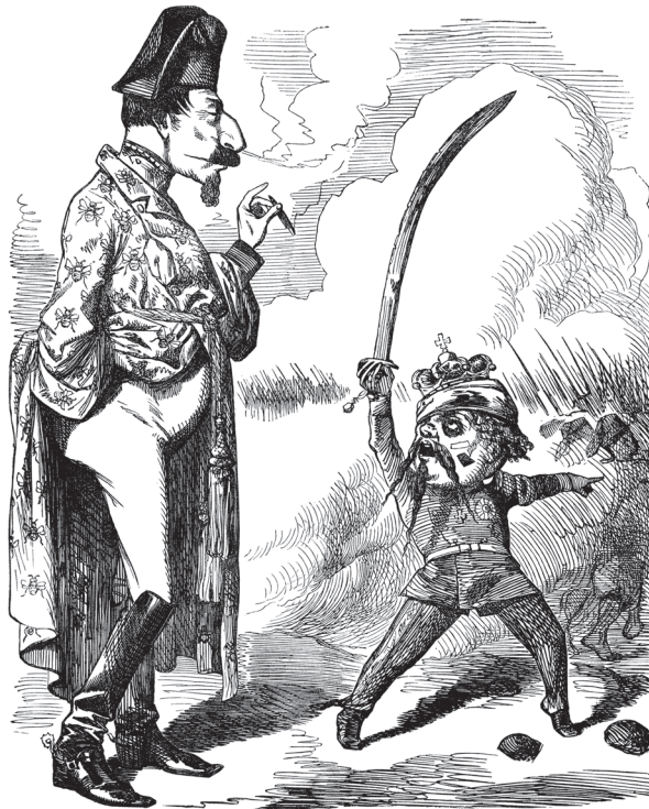
THE GIANT AND THE DWARF.

A cartoon published in Britain in June 1859. Napoleon III, on the left, is saying to King Victor Emmanuel, 'Bravo, my little fellow! You shall do all the fighting and we'll divide the glory.'