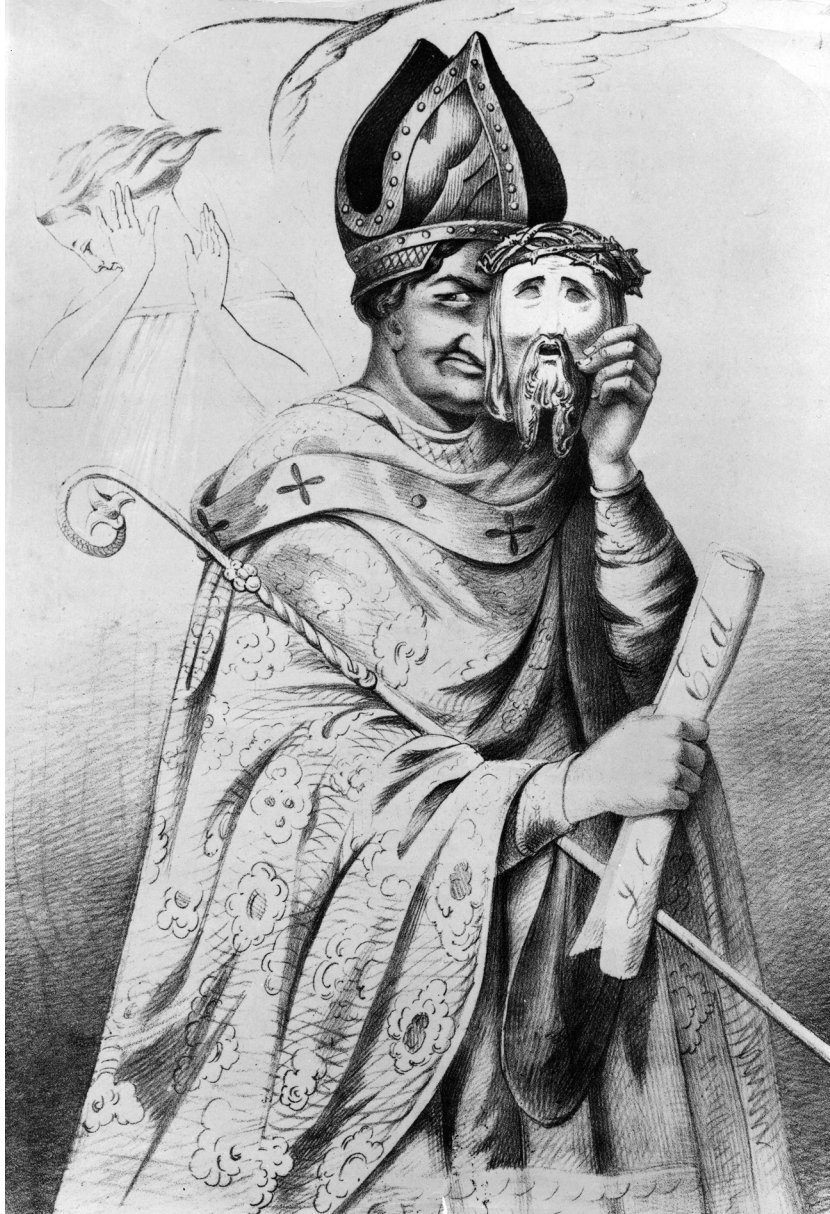
A cartoon of Pope Pius IX published in 1852. He is holding a mask of Christ.